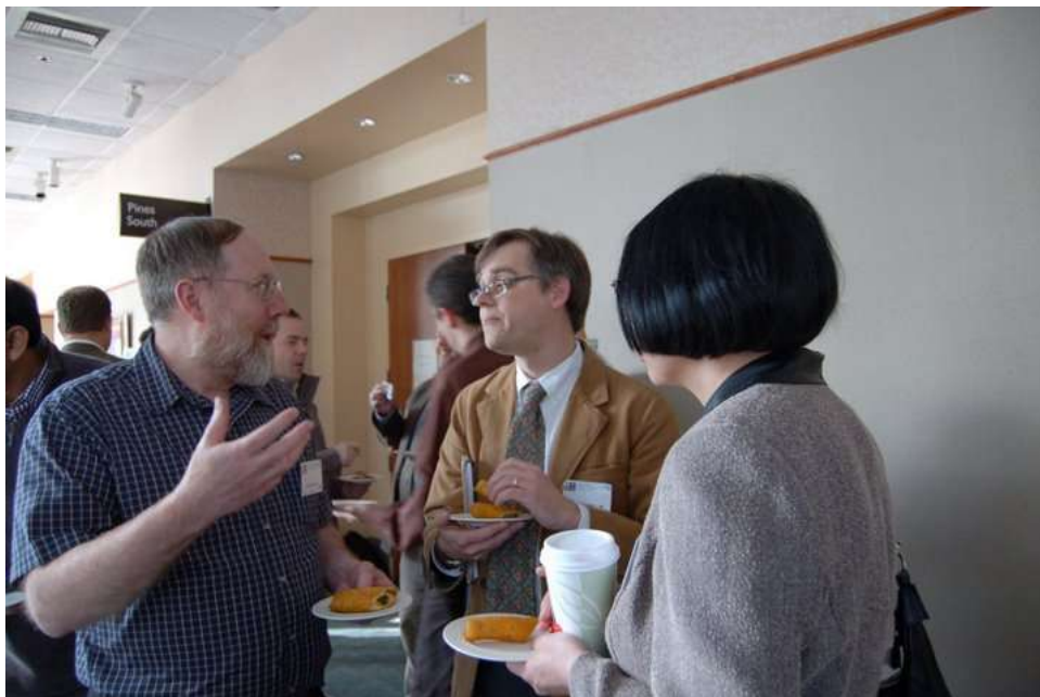
Figure 3. WMED Provides Unique Networking Opportunities