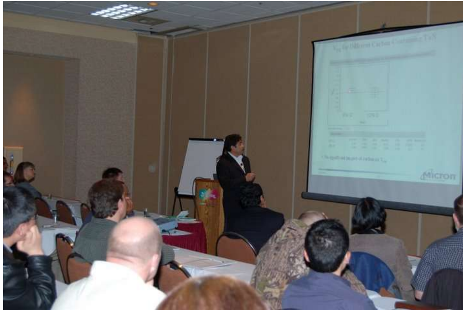
Figure 2. Technical Presentations Throughout the Workshop