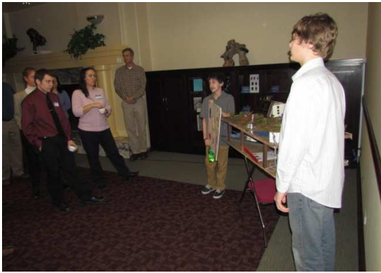
Riverstone School Future City team