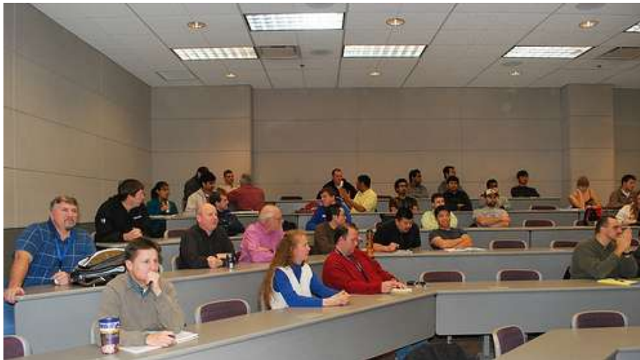
BSU event, 12/2/2009: Attendees at the short course "Challenges Near the Limit of CMOS Scaling"